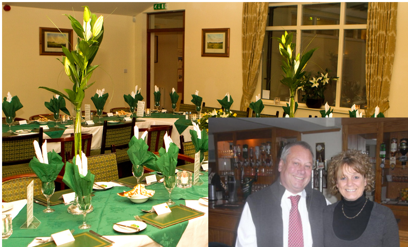
New Mills Golf Club combines a down to earth family friendly membership with very professional catering / hospitality

Own buggies can be used on the course but this needs to be arranged in advance and full insurance documents accepted by the Professional.